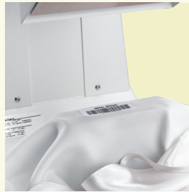
Free lower plate for unnumbered operation