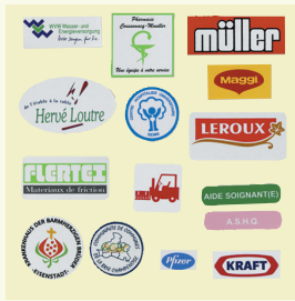
Emblems and transfers